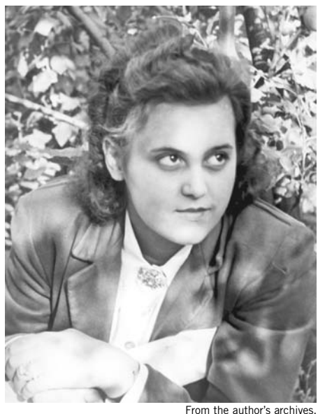
"Our beloved Lyalya."

bustling about them. Off to the side lay our beloved Lyalya, unattended, completely naked.