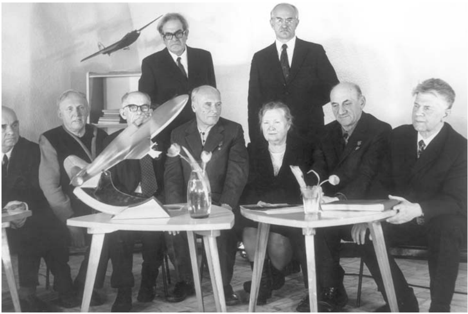
From the author's archives.