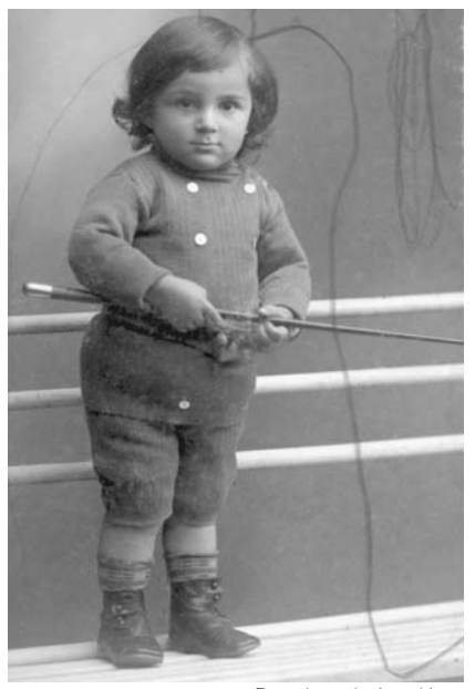
The author at the age of two in Lódz, Poland—1914.

shiny to some man, and he measured out something for her into a white bag maybe flour, or groats.