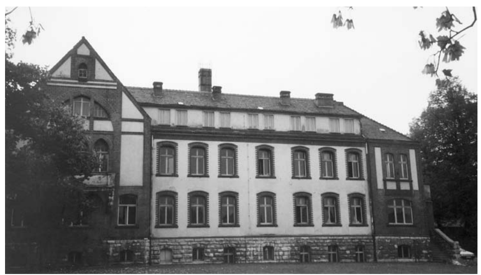
Main building of the Institute RABE in Bleicherode, 1992.

From Nordhausen they transported the priceless windfall that had been stored there—the gyro-stabilized platform. But our staff still did not have anyone who would dare start studying it. Therefore, they placed it in the future gyroscopic instruments laboratory, which they locked and sealed.