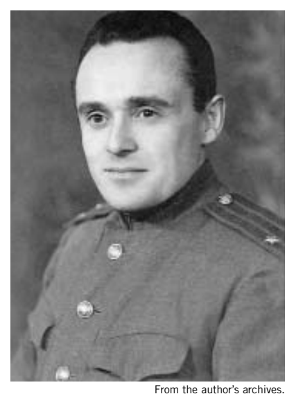
S.P. Korolev in Germany, November 1945.

Several days later, Korolev arrived in Bleicherode with the plenary powers to create the Vystrel (shot) group. The tasks of this new service included the study of missile pre-launch preparation equipment, ground-filling and launch equipment, and aiming equipment; flight mission calcula-