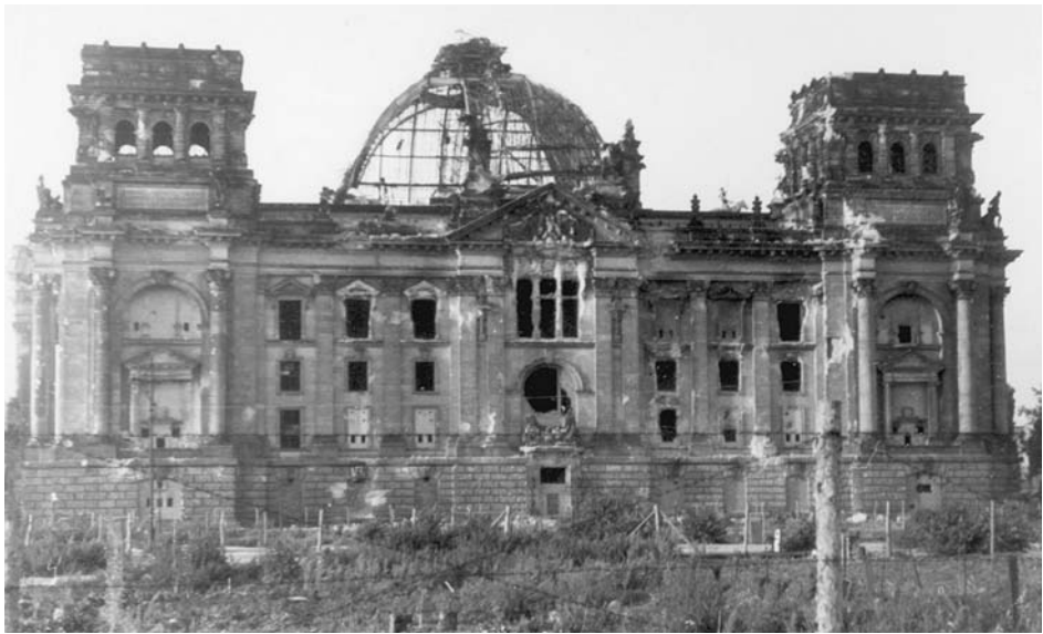
Reichstag. Berlin, 1946.

While we were at the Reichstag, very close by at the imperial chancellery the Nazi leaders were rejecting the demand for unconditional surrender. We didn't know this, of course, and when we were getting ready for the trip back to Buchow,